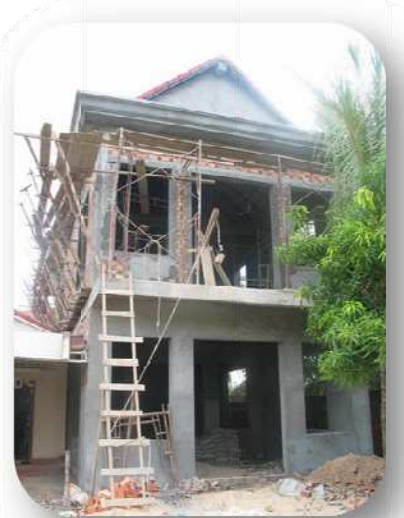
May 2010: Almost finished!

JWOC is celebrating FIVE years of working in Southeast Asia this year! Why not visit our anniversary webpage to find out what that means to us?