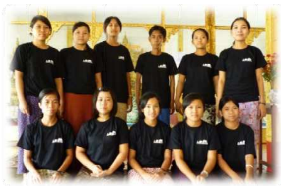
JWOC Scholarship students in Myanmar