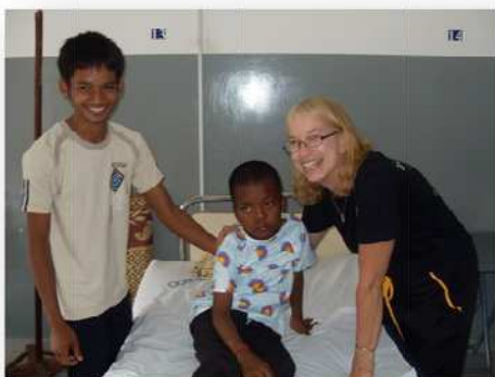
Yung recovers in hospital after his life changing operation.