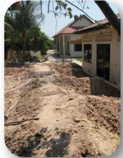
February 2010: The Foundations of the new building.